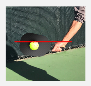
Figure 4-2 (illegal serve)