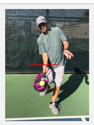
Figure 4-1 (legal serve)

part of the wrist (where the wrist joint bends) (see Figures 4-1 and 4-2).