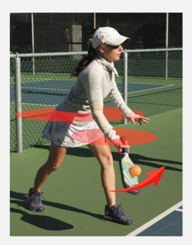
Figure 4-3 (legal serve)